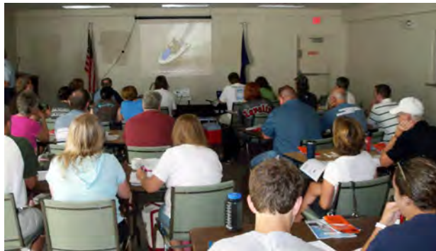
Twenty-eight attend July PE Class